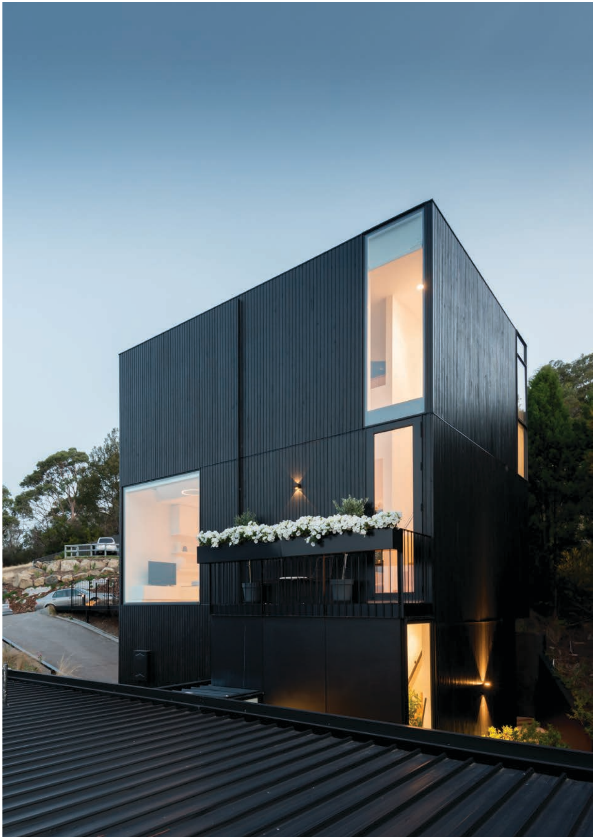
Grancillary Dwelling Crump Architects — Commendation TAS Residential Architecture - Houses