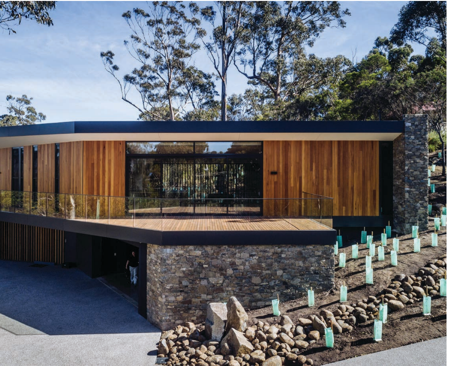
The Stringybark Residence JAWS Architects — Commendation TAS Residential Architecture