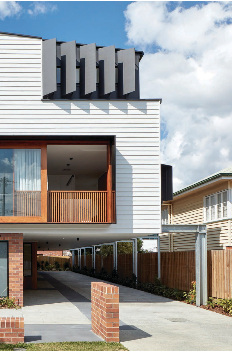
Smallman Street Townhouses Reddog Architects — Commendation QLD Residential Architecture — Multiple Housing